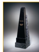
KODAK Gallery Elite Award

All Gallery Elite Award winners will be presented with a statuesque, sculpted granite trylon, signifying lasting dedication and commitment to the art of photography.